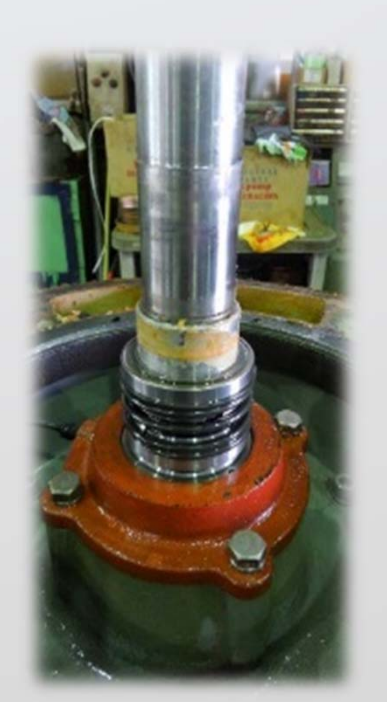
Disassemble every parts and check inside to inspect wear parts.

Start with removing the dirt with shot-blast machine.